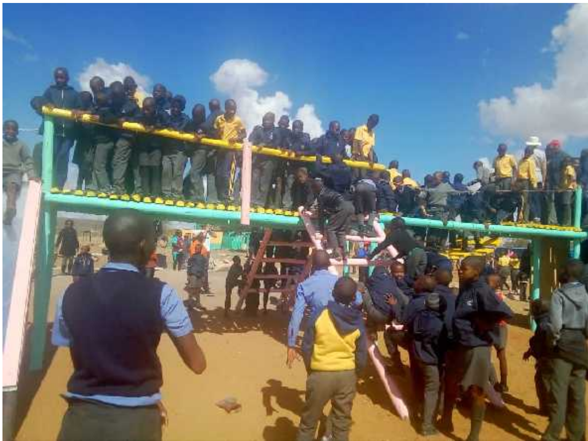
Top left: Students from the International School of Paris with some of the children. Top right: Sampling the newly built slide. Above: The children gather for the opening of the adventure playground.