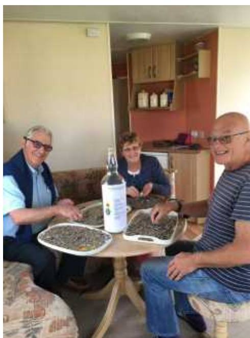
Counting the 5p's!