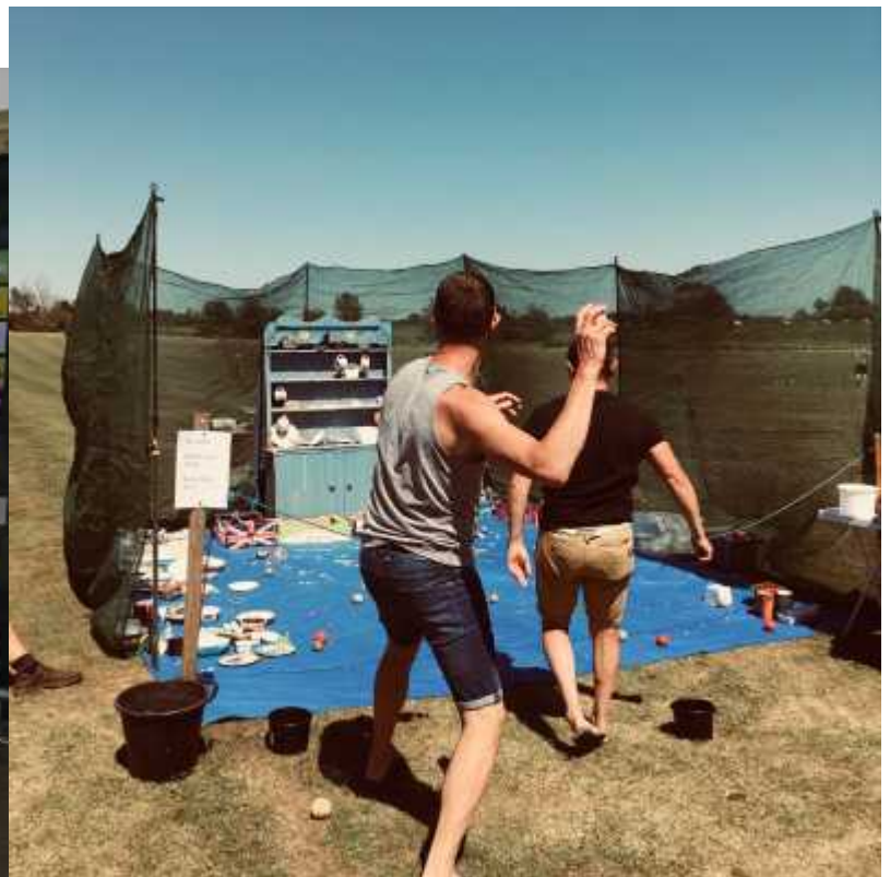
Stress being relieved at our china smashing stall!