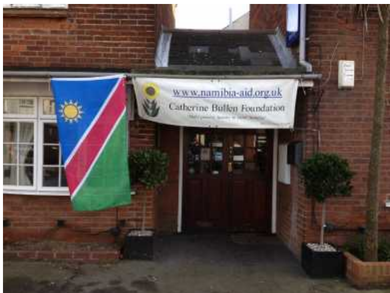
Titash Indian Restaurant in West Mersea. Waiting for the guests to arrive