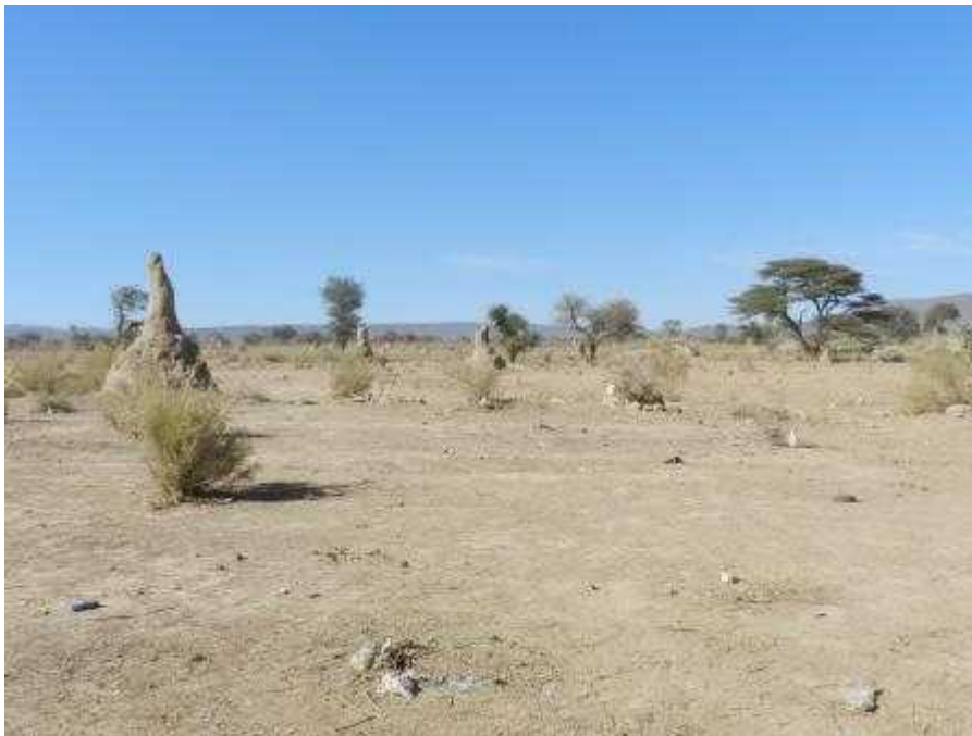
Arid landscape in Kunene region.

Luckily the area was not registering any cholera cases, which also pose a risk when the rains finally arrive, and the Sister reported that there weren't high incidents of malaria.