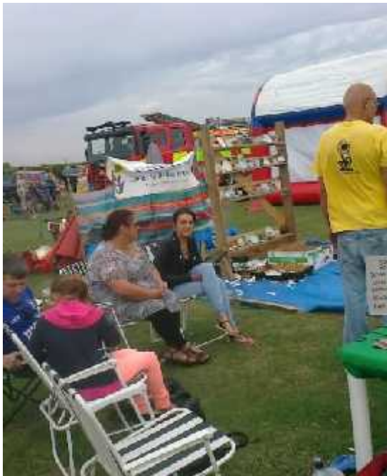
Our china smashing stall at the West Mersea Lions Summer Show

This is where we do need your old china. This is the stall we now take to fete's and shows. Our last show was the West Mersea Lions Summer show on 17 August where we raised £212. Our next outing is on Sunday 8 September at Colchester Lower Castle Park attending the Colchester Lions Car Show followed by another Car Show at Clacton on Sunday 22 September.