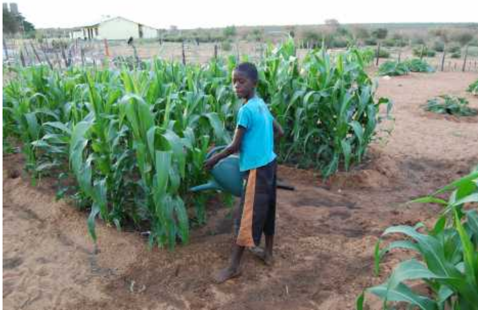
Maize being cultivated in the hostel garden. In the background in the nurse's accommodation at the clinic.