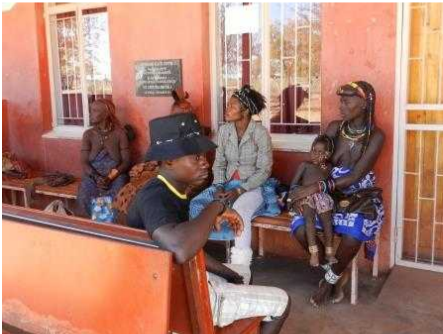
ovaHimba patients waiting outside the local clinic.

The Sister told us she saw between 50-80 people each day. Most suffered from a mix of respiratory diseases (including pneumonia), diarrhoea and skin disorders exacerbated by the dry, dusty conditions. Really serious cases had to be referred to the hospital in Opuwo.