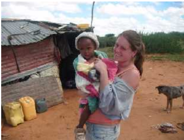
Myself and a San child during our Outreach trip, wrapped in a blanket knitted by ladies from West Mersea

I flew out to Namibia and was met by Roger and Linda at the airport at Windhoek. From there we went to a lodge called the Olive Grove before travelling up to Ojtimanangombe the next day where the clinic is situated. The following two weeks was crammed with nursing as a volunteer in clinics, schools and outreach projects. On outreach we took a 4 x 4 and drove out into 'the bush' whereby we would assess the healthcare needs of families and treat as best as we could from the back of a vehicle.