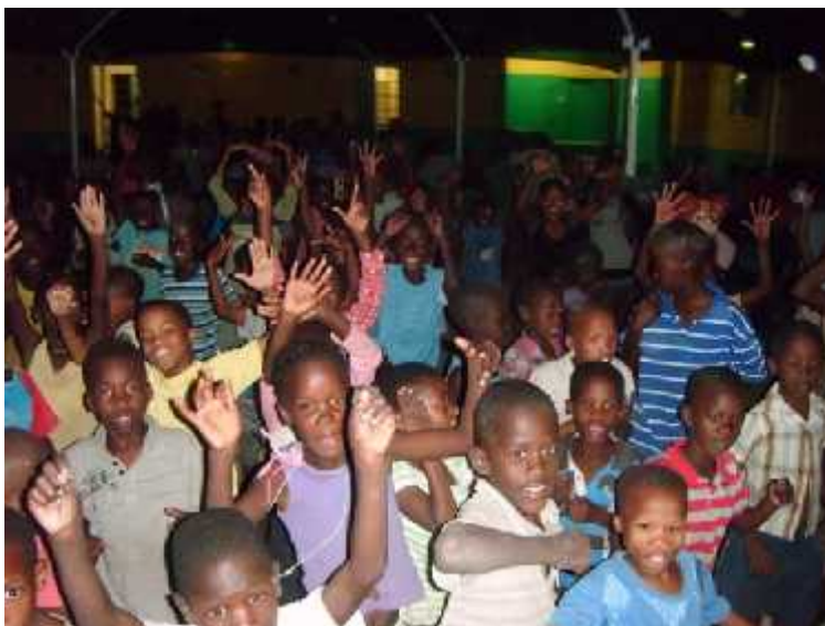
Children at the hostel enjoying the Independence Day disco

We also celebrated the day with a disco for the hostel children where we could have hosted the 'Namibia's got talent' contest. They all had moves like Jagger and thoroughly enjoyed themselves.