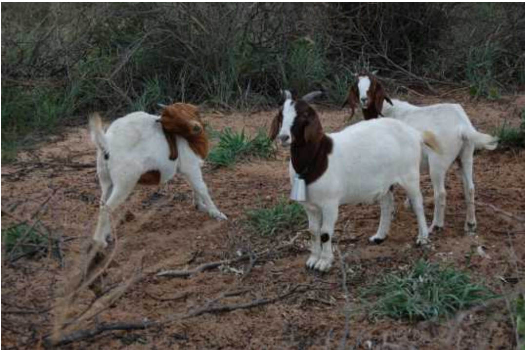
Some of the goats donated to the family.