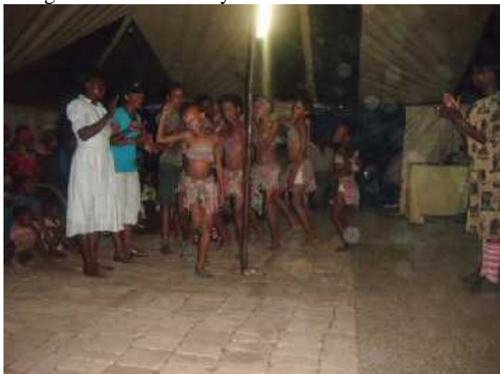
San children performing traditional dances.