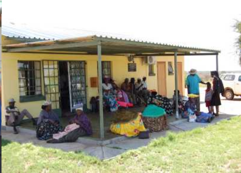
Patients waiting to see either the doctor, dentist or optician on their monthly visit.