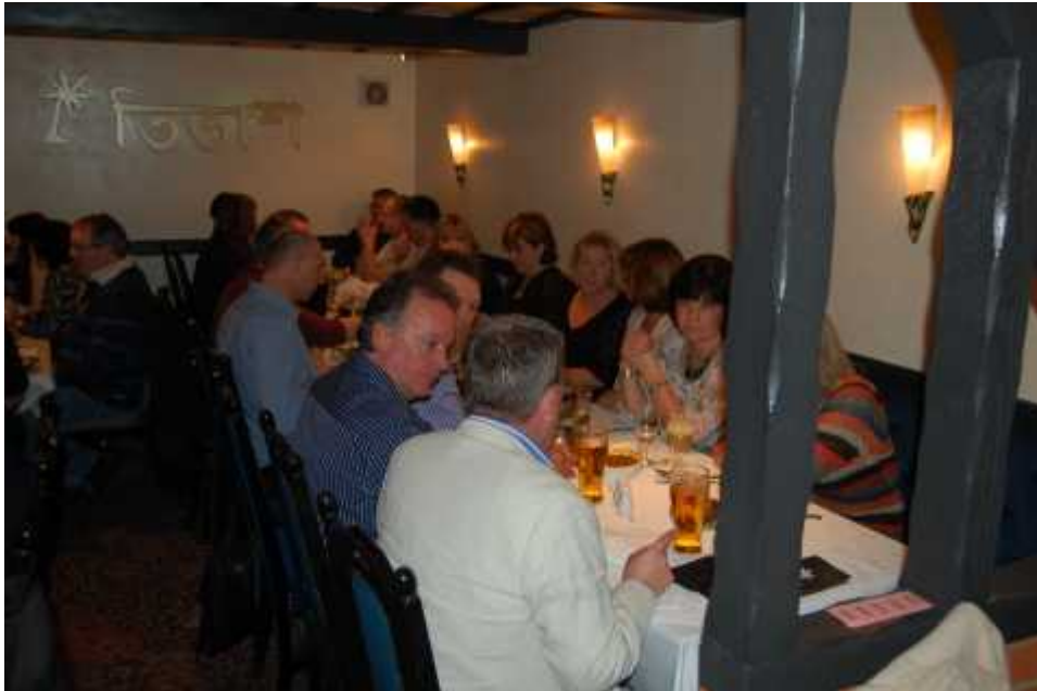
Some of the guests at the Indian Lunch.

The Indian Lunch held on 26 February 2012 at Titash Indian Restaurant in West Mersea has now become an annual event and tickets are eagerly snapped up as soon as they come on sale. This year we managed to squeeze in a record eighty people to enjoy the marvellously prepared lunch. A total of £1,067 was raised including proceeds from the raffle.