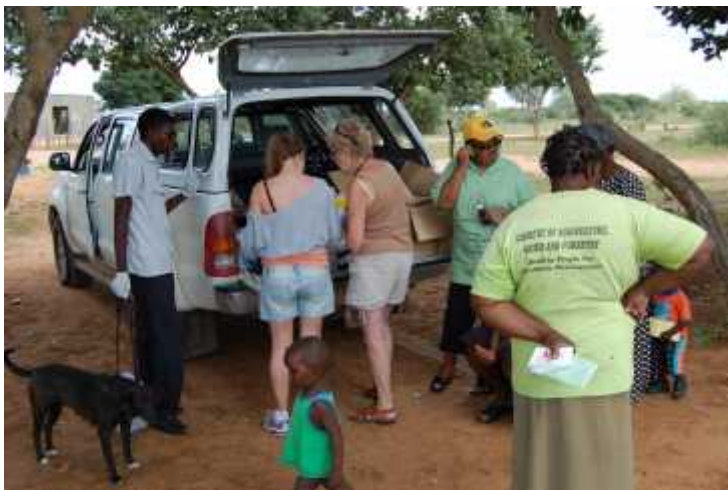
Undertaking an outreach visit into the bush.