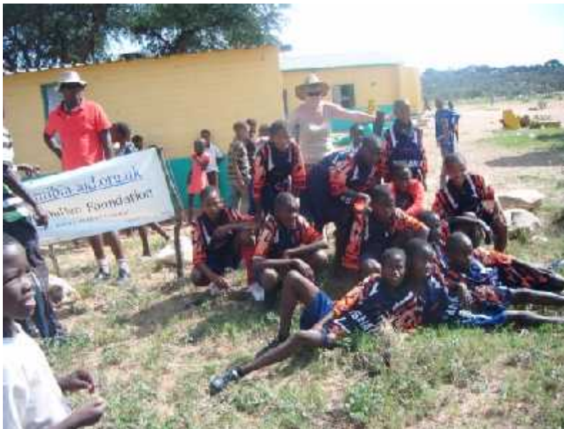
One of the school teams playing in the football tournament