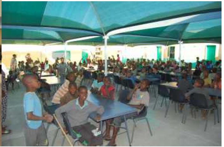
In October 2011, a formal kitchen and dining area built by the Foundation was opened at Omuhaturua Primary School Hostel. This replaced the cooking pots on fires outside and provided a covered seating area for the children.