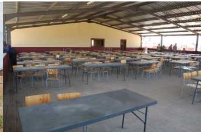
In October 2016, the Foundation opened a formal kitchen and dining area that it had built at the Eiseb Primary School Hostel. Left: A general view of the building. Right: The dining area which seats up to 300 children with the kitchen in the background.