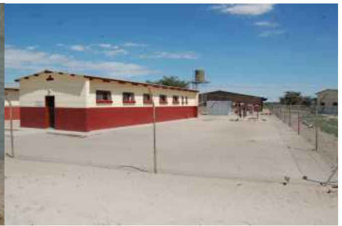
Left: In April 2015, the Omuhaturua Primary School Hostel put in a request for chickens to provide eggs for the Hostel. The Foundation posted an appeal on Facebook and within 48 hrs it had had pledges for 50 chickens. Right: In October 2015, the Foundation opened a 40 bed dormitory that it had built to alleviate overcrowding at the Eiseb Primary School hostel.