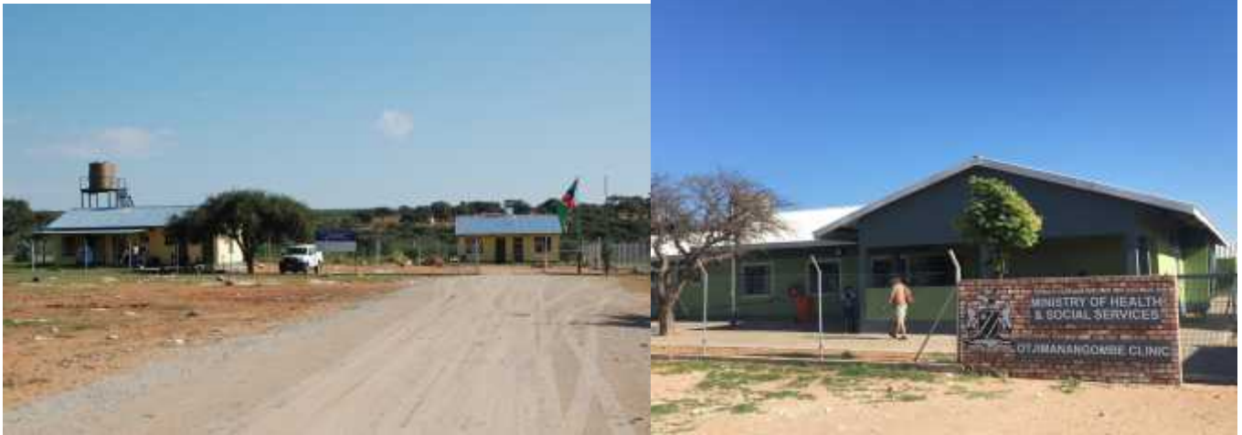
Left: The Otjimanangombe Primary Healthcare Clinic and accommodation constructed by the Foundation in 2008. Right: The clinic was extended by the Global Fund in 2018.