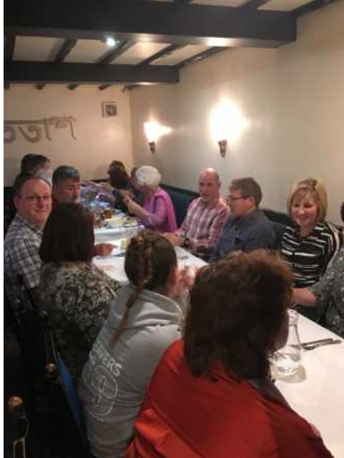
Some of the guests at the Indian lunch