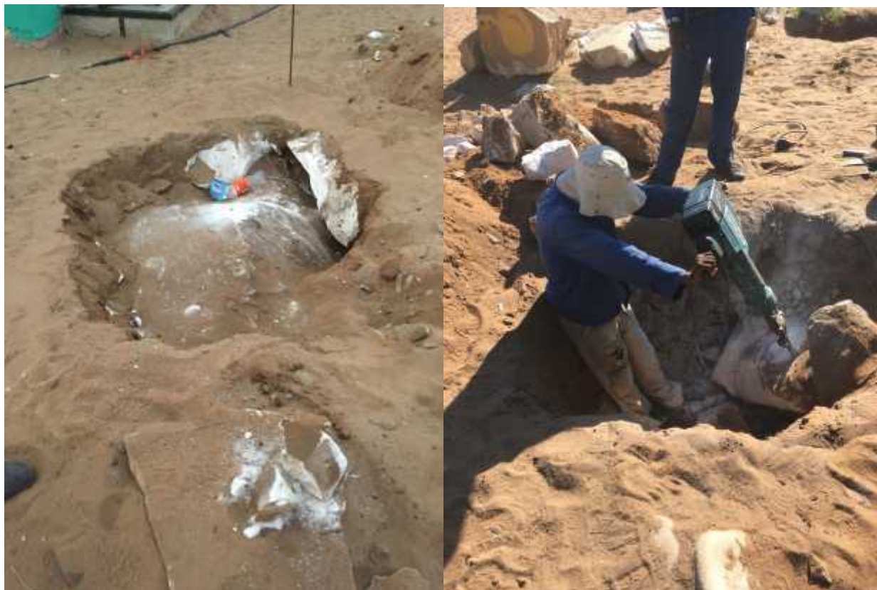
Excavating the foundation holes for the steel uprights, not made easy by stubborn rock.

The first phase of construction, the digging of foundation holes for the steel uprights has not proved easy. The sand hides the rock just below the surface, and in some cases Riaan's men had to light fires in the rocks to heat them up and then cool them with water to encourage the rock to split.