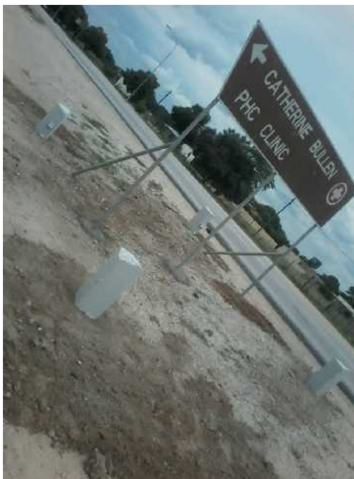
The re-erected sign with the concrete obstacles