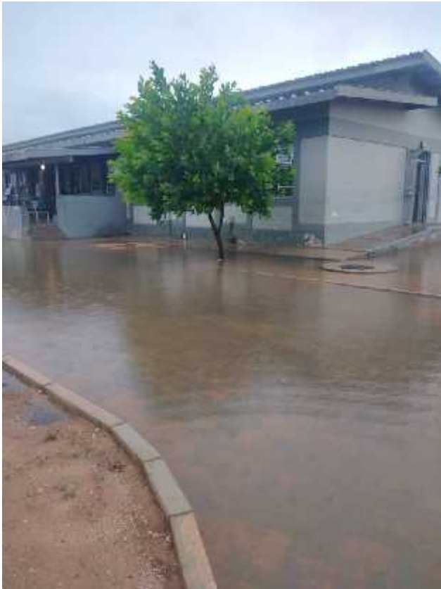
Catherine's clinic after a rain storm

After years of lower than average rainfall and drought conditions, the past few months have seen record levels of rainfall in most parts of the country. The newly commissioned Neckartal Dam in the south of the country near Keetmanshoop was filled to overflowing with other dams reporting significant inflows.