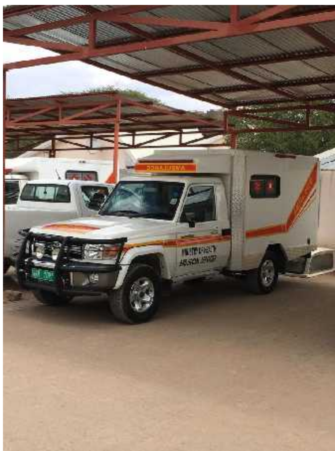
A 4x4 ambulance similar to the one that the Foundation is fundraising for.

We have briefly mentioned before that the Foundation is fundraising to provide a 4x4 ambulance for the Omaheke region of Namibia to be based at the Otjimanangombe Primary Healthcare Clinic. This rural clinic was built by the Catherine Bullen Foundation and handed over to the Namibian Ministry of Health in July 2008. It was extended by the Global Fund in 2018.