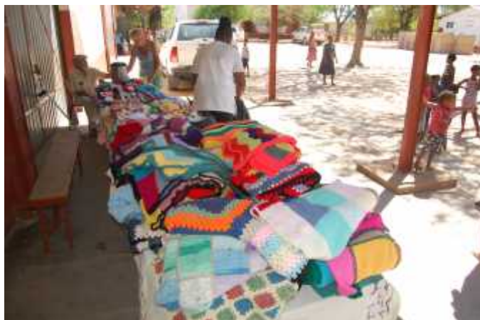
Knitted items laid out ready for distribution.