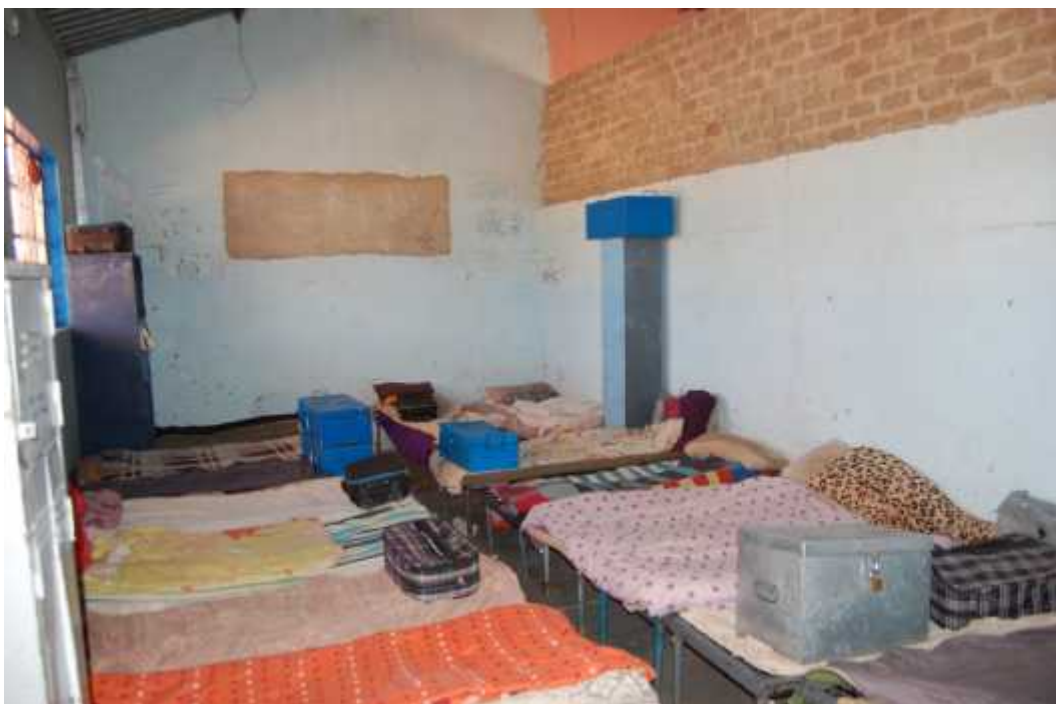
The boy's dormitory at Hippo Primary School in need of refurbishment

Secondly, they visited Hippo Primary School where they were requesting help to refurbish a boy's dormitory and toilet/shower block at the hostel with the Foundation buying the materials and the local labour carrying out the work. Again, this would be referred to the trustees for consideration.