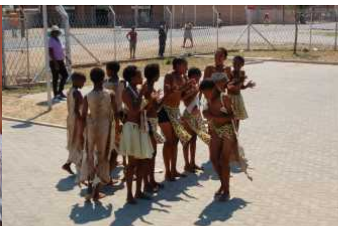
The Ombili Foundation Cultural Group performing at the clinic.