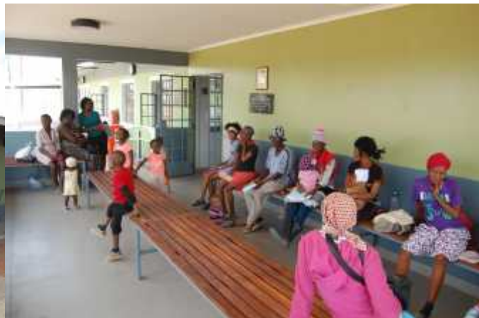
Patients in the waiting area before being called into the clinic