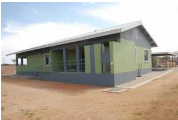
Entrance to the TB section.