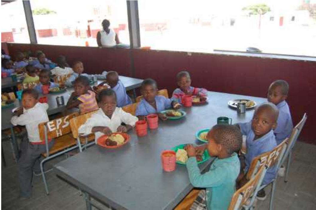
The hostel children enjoying a nutritious meal from the kitchen and sitting in the dining area, both provided by the Foundation. This scene always brings 'a lump to one's throat' as this is a classic example of a project in action.