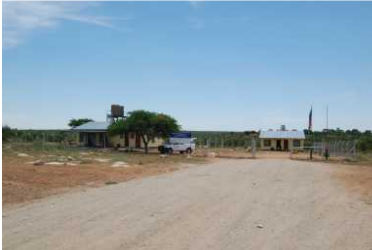
The newly opened clinic in 2008.