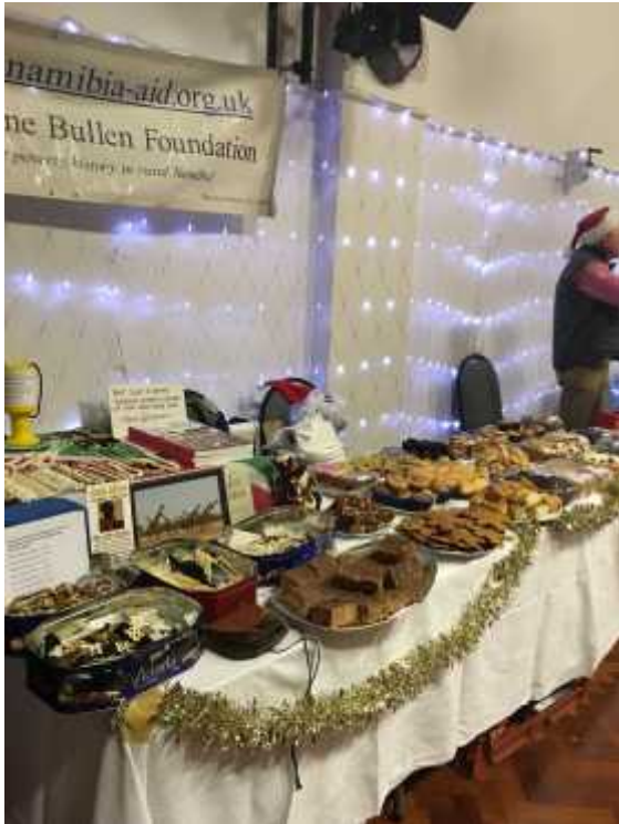
The Foundation's stall at the Mersea Lights up.