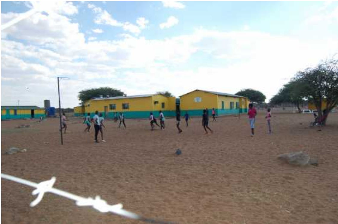
A view of Omuhaturua Primary School hostel. To the left of the picture is the site of the new multi-purpose hall.

While they were at the clinic, Linda and Roger had a site meeting at the adjacent school hostel to finalise the construction of the multi-purpose hall with their builder, Mr Riaan Potgieter. During this meeting it was decided to extend the building slightly, to include a stage area and two small storage rooms. Construction is scheduled to commence this month. The building is fully funded, and the Foundation is now raising funds to provide the indoor sports equipment, tables and chairs.