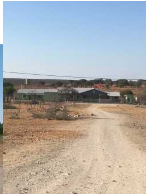
The extended clinic in October 2018