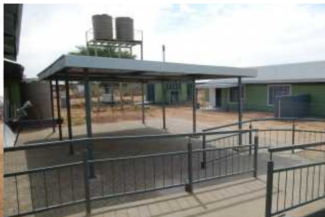
The rear of the clinic with new accommodation units to the right.