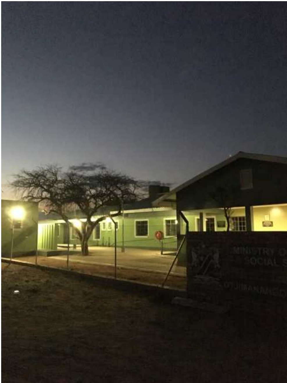
Otjimanangombe Primary Healthcare Clinic, Omaheke, Namibia

The Catherine Bullen Foundation would like to wish everybody a happy Xmas and prosperous New Year