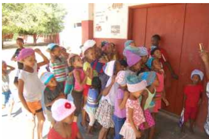
The San children with their woolly hats and headbands.