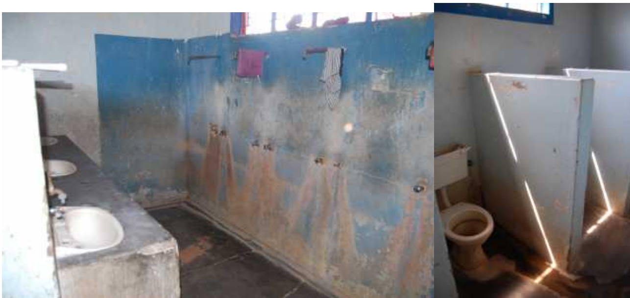
Showers and toilets also need renovating at Hippo Primary School Hostel.