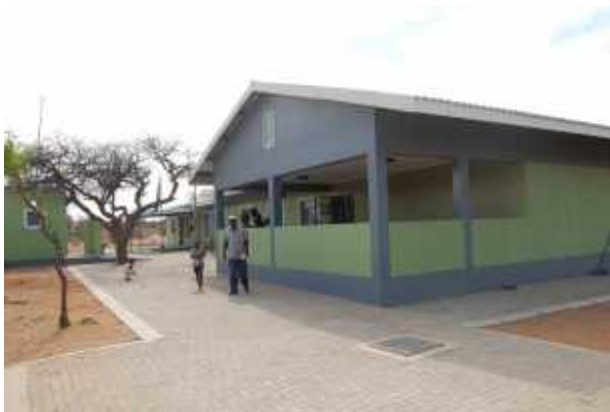
The front of the clinic with the covered waiting area