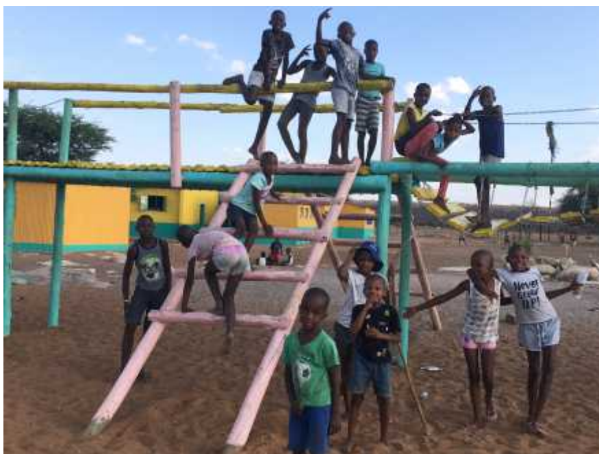
The children of Omuhaturua Primary School Hostel enjoying the new adventure playground.

A few days later they travelled to the Omaheke Region in the north east and its capital Gobabis. Then it was into the bush to Otjimanangombe, partly on gravel roads with clouds of dust following the car as it had not rained since April. On reaching their destination they settled down in a vacant teacher's house which would be their home for the next three and a half weeks. It was good to see the hostel children playing on the newly built adventure playground which had been provided by the International School of Paris, the Foundation's French partner.