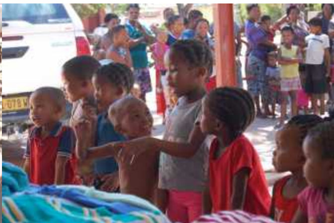
The San children waiting in anticipation