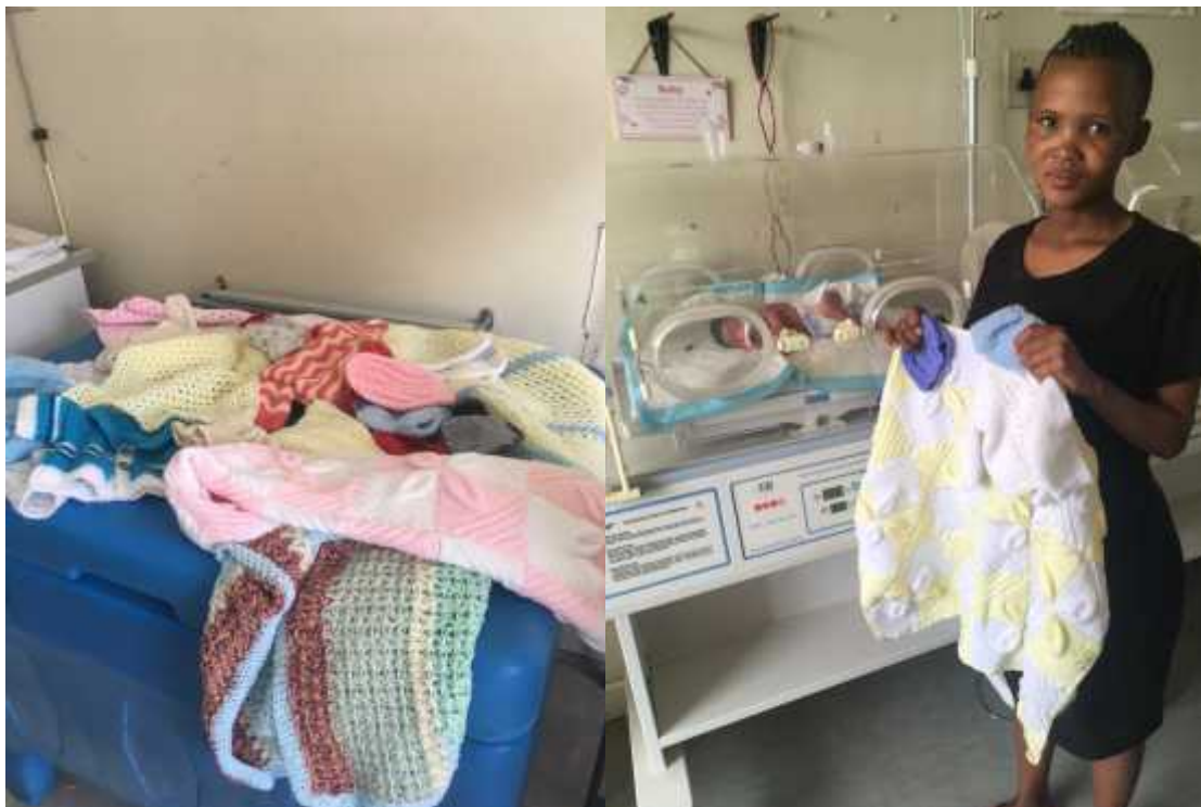
Left: Donated items. Right a San mother with her baby which weighed 1.4 kgs at birth