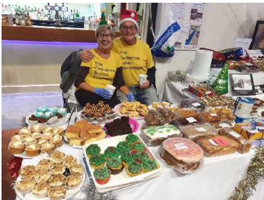
Our stall at the Mersea lights up

As at St Peter’s Brewery, we had our homemade cake stall plus the San Jewellery and the Foundation’s 2020 Calendar. The total raised was £180. Another big thank you to our cake makers who supplied us with lovely cakes to both events within a fortnight.