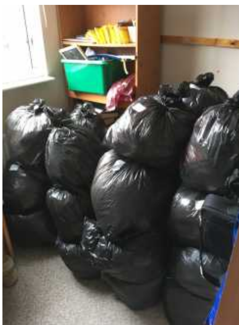
Sacks of knitted items awaiting transportation to London