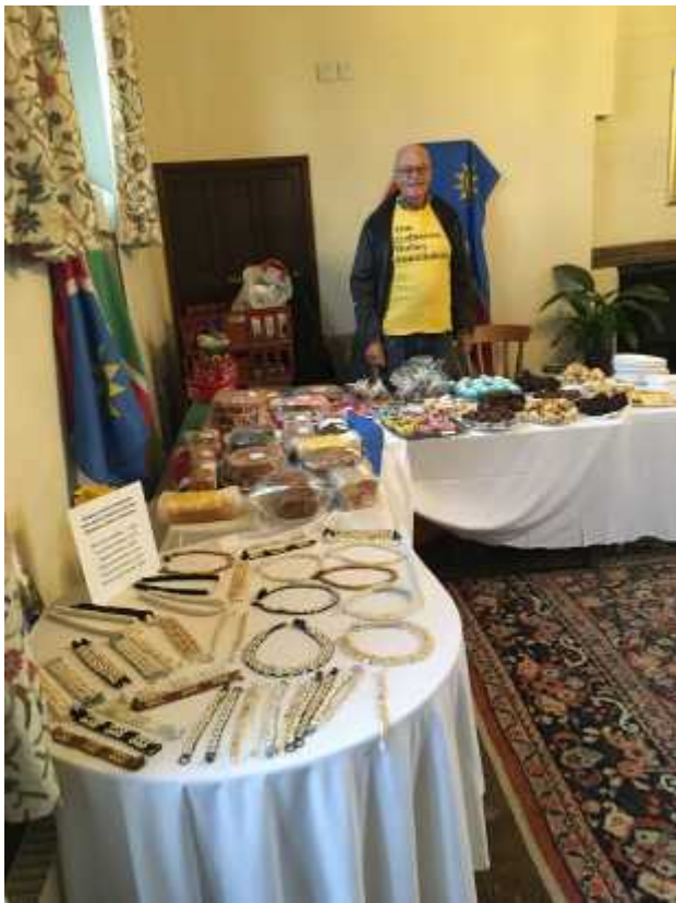
The Foundation’s stall at the Christmas Market at St Peter’s Brewery.