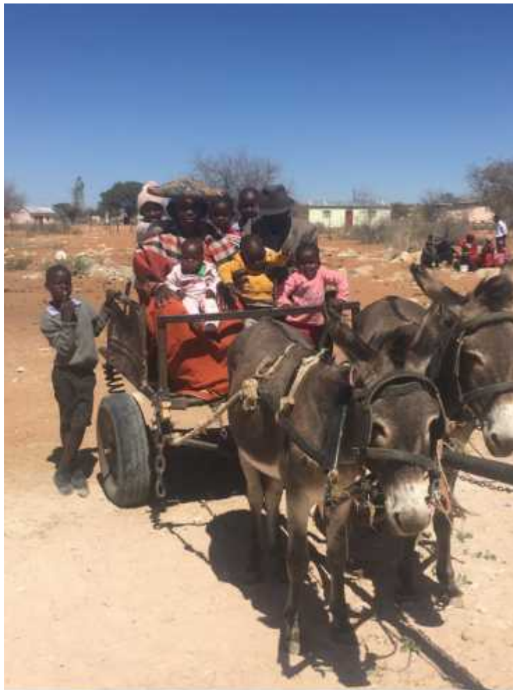
Christmas Donkeys at Otjimanangombe

The Catherine Bullen Foundation wishes you all a happy Christmas and prosperous New Year