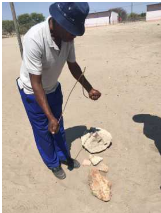
The water diviner with his twig in the vertical position indicating that there is water beneath the surface.

At this point, it was naively thought 'job done' and drilling could start as soon as the rig became available. However, events then took a strange twist. Komeho, our Namibian ngo partner wanted a borehole drilled at their Vocational Training establishment at Vasdraii near Gobabis to provide water for irrigating a large horticultural garden. They had the same contractor as the Foundation and his water diviner identified a spot to drill. The borehole was drilled and was proved to be dry, which meant that although no water was forthcoming, Komeho had to pay for the drilling and this apparently is standard practice throughout the industry. Komeho also employed a hydrologist who identified another location and a different contractor drilled there. Disappointingly water was found but the flow was not sufficient for irrigating a large area.