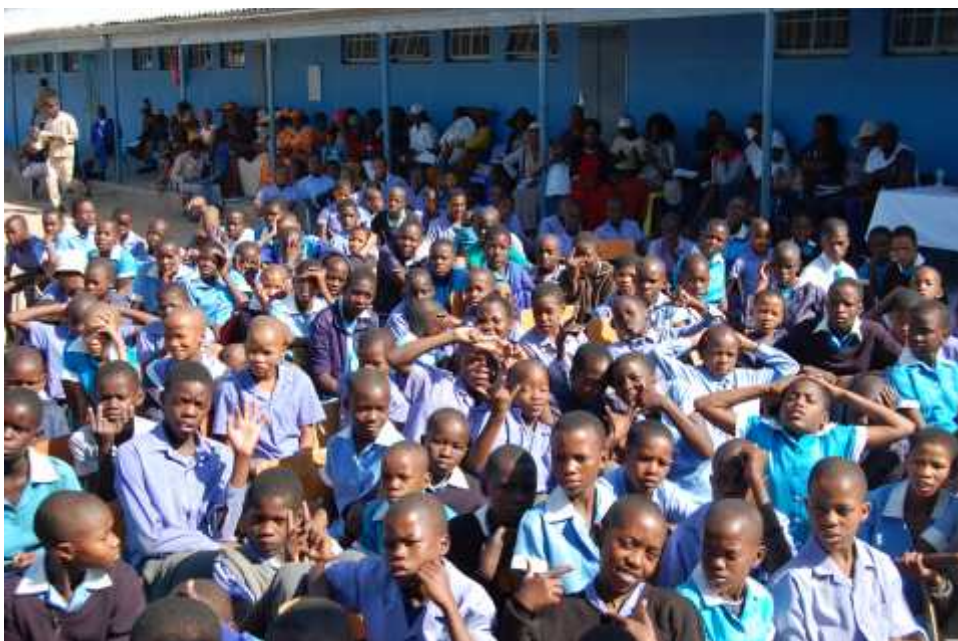
The pupils of Good Hope Primary School at the annual prize giving event.