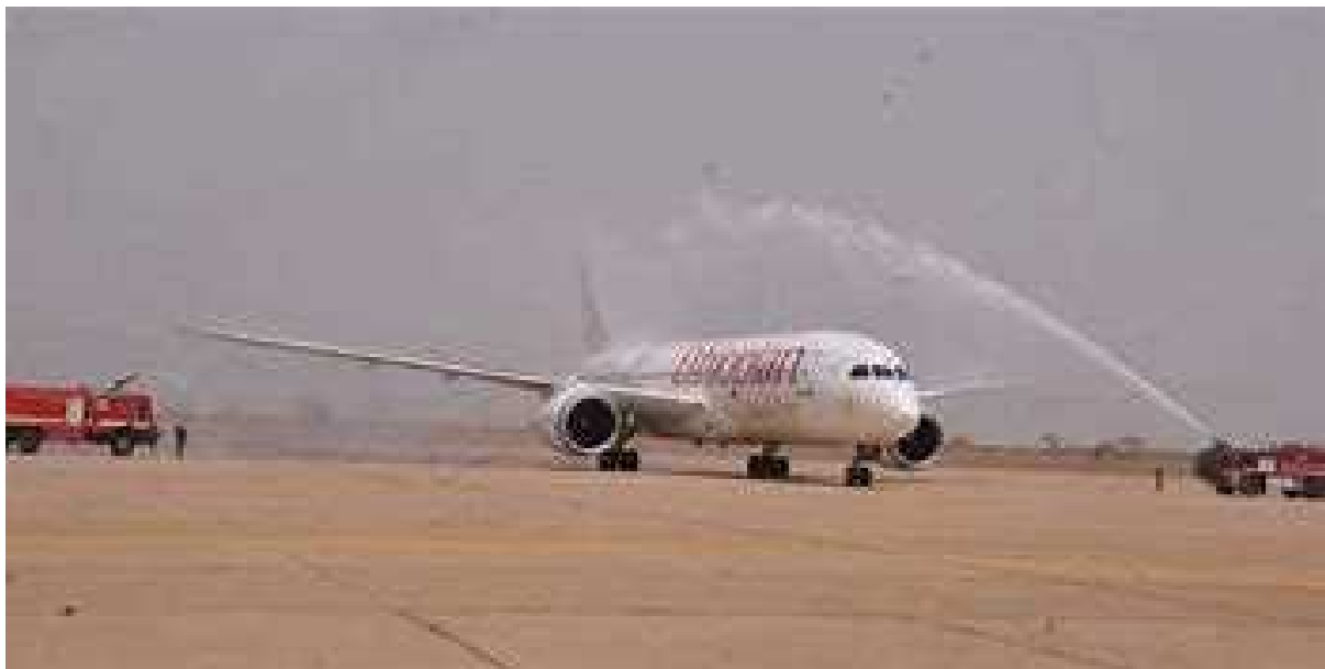
September 2020 – Ethiopian Airlines resume flights to Namibia

While the UK has been reporting daily cases in their thousands and deaths in the hundreds, Namibia through good governance and its geographical profile has managed to record only 17,276 cases since the beginning of March with 164 deaths as of 16 December. However, cases are now on the rise again, and there is fear of a second wave which has led to a tightening up of restrictions. Since the beginning of September, the Government has been encouraging tourists to return with the opening of borders with Ethiopian Airlines and Eurowings now flying into Windhoek. Recently, the UK Foreign Office added Namibia to its travel list.