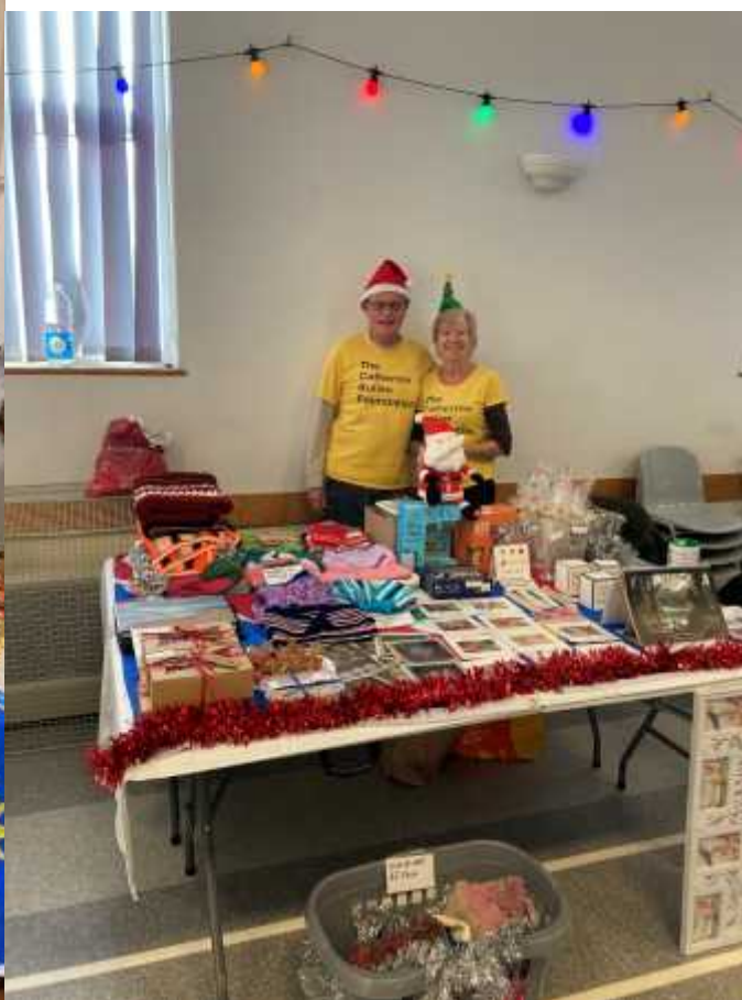
Wix Christmas Fayre