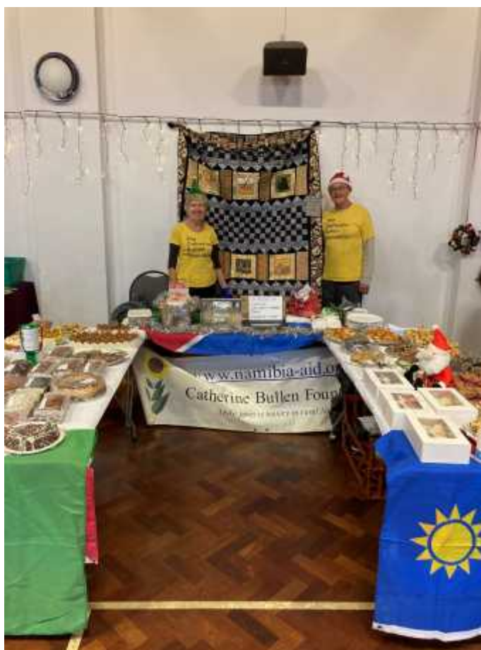
West Mersea Lights Up.

On Sunday 5 December, we attended Wix Christmas Fayre with our sales stall, selling knitted items, calendars and cards where we raised £79.