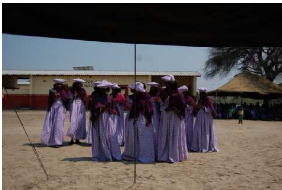
The senior girls in their Hereo dress performing a traditional dance at the opening ceremony. These and their class mates will be occupying the new dormitory.