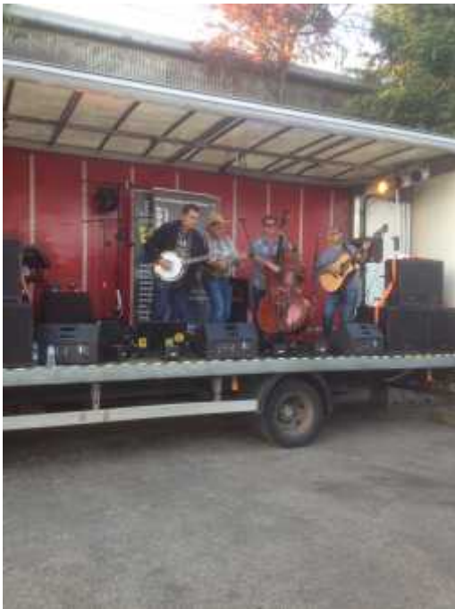
Bands night at the Coast Inn