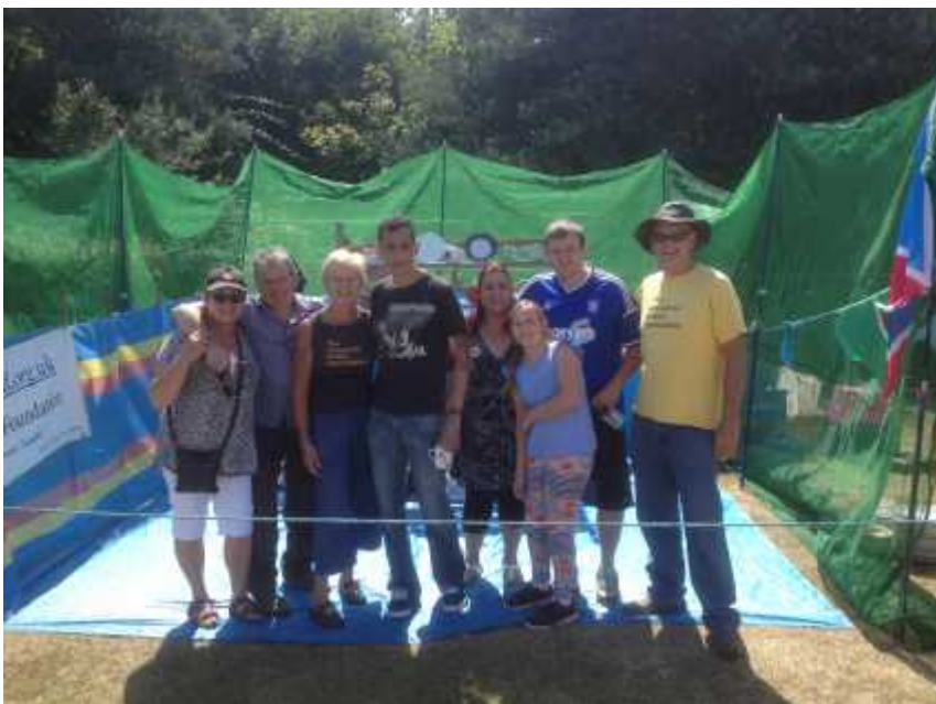
Our team at the Mersea Island Lions Summer and Transport Show.