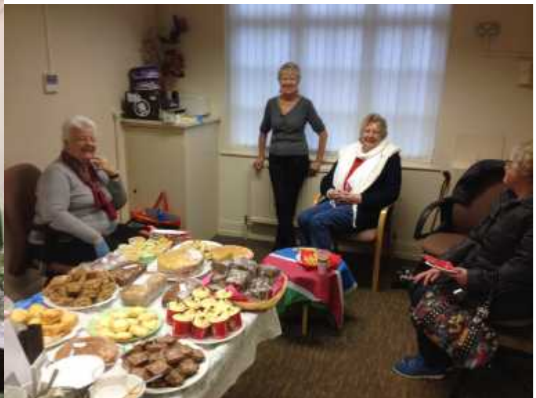
Our stalls at the Mersea Lights Up and the Coffee morning at Barclays Bank