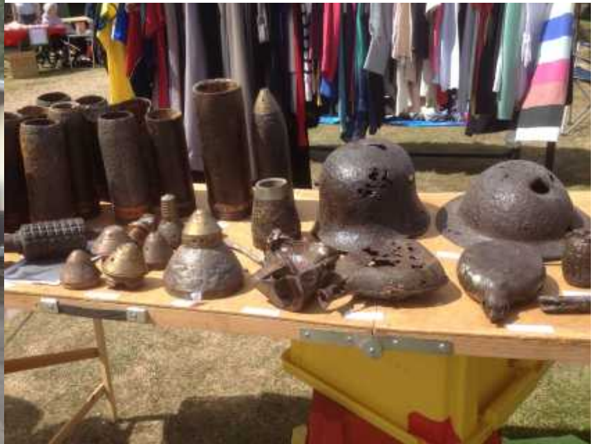
Our sales stall at Flixton