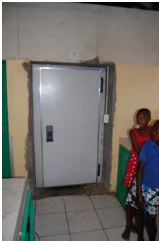
The new cool room

Since the opening of the kitchen constructed by the Foundation in 2011, the headmaster has been receiving a subsidy on a per pupil basis per term. This money is used to pay hostel staff, to purchase food for the children in the hostel and to fund hostel maintenance. Through good house keeping the school has managed to fund the installation of a cool room in one of the kitchen storerooms for food storage.