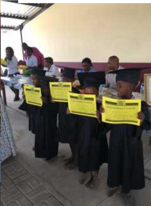
Pre-Primary school children with their certificates, 'graduating' to the next class.

Once the prize giving was finished, we cleared the area and put out the tables at which 300 children would eat. It was good to see everything in place. It was an emotional moment to see the smiles on the faces of the children and staff, and made us realise what a difference the Foundation had made. None of this would have been possible without the support of the people at home. With that task completed, we said our farewells and drove back the 100 miles to Otjimanangombe where Linda returned to volunteering in the clinic for the rest of our stay.