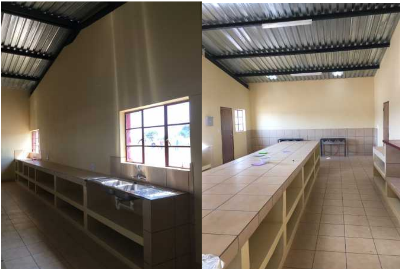
Two views showing the interior of the kitchen.