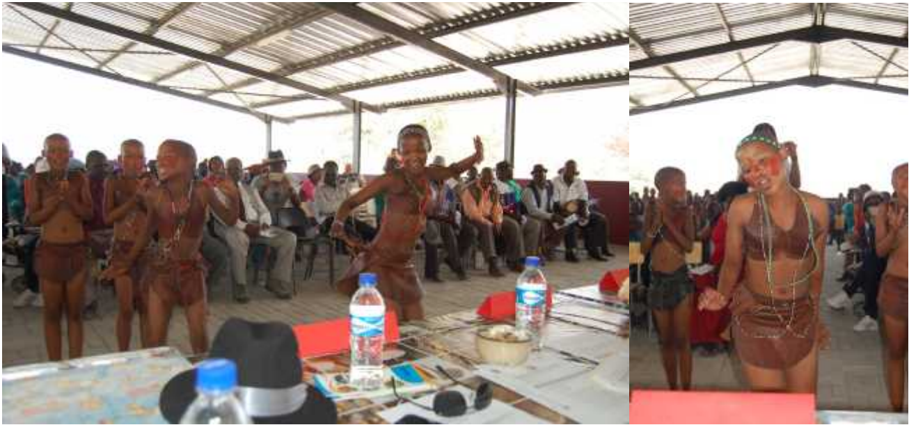
The San children performing their traditional dances

There then followed a cultural performance by San children who at the end presented us with a decorated walking stick