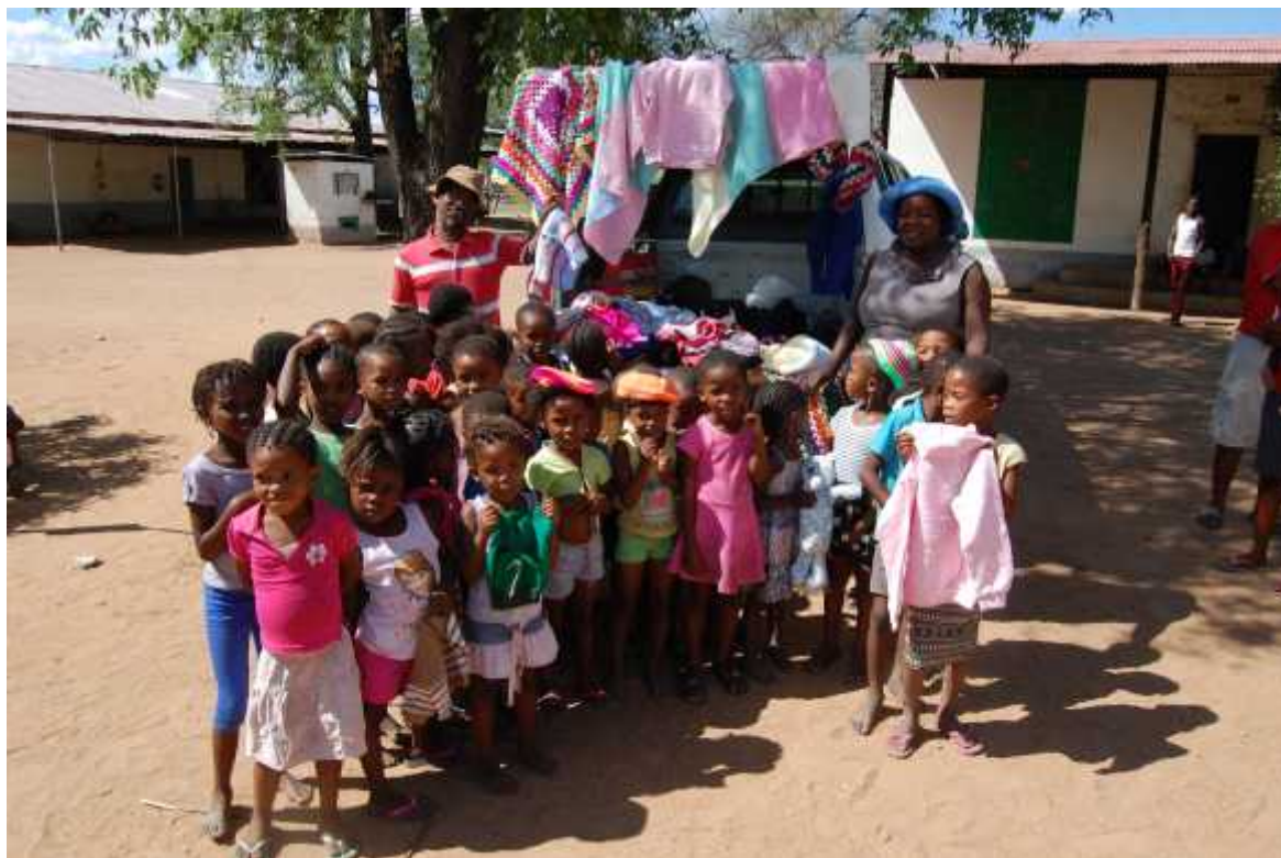
The San children at the Ondera Resettlement Farm receiving the knitted items and the Regatta tops.

We also visited Ondera Resettlement Farm which is home to the San who used to live in squatter camps around Oshivelo. Here we distributed knitted items produced by ladies in West Mersea and Colchester and also gave out some t-shirts and tops donated by the West Mersea Regatta Committee. While we were there we were asked if we would help their soccer team, the 'Ondera Super Stars' who are quite successful and are looking for kit, goal nets and balls. We would be unable to transport these items to Namibia, so we are looking for funding to purchase these items there. If you know of any football clubs who would like help this team by raising funds, please let us know.