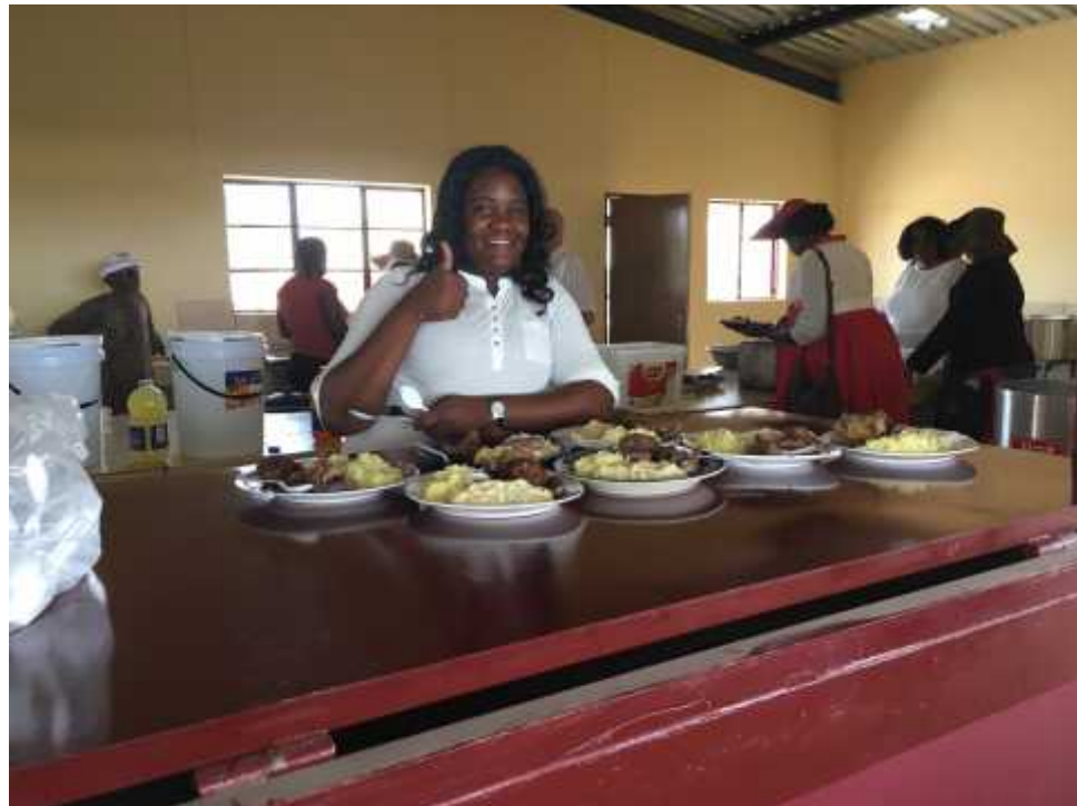
Lunch is served. The first meals to be served from the new kitchen.

At the end of lunch, the NGSIP guests and the British High Commissioner left and everybody else stayed for the prize giving. We presented some of the prizes and one of the San girls achieved 100% in maths and high marks in other subjects and was the best pupil in the school. She got around £30 from the