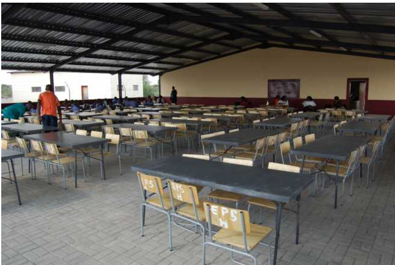
The dining area with the chairs and tables in place to accommodate 300 children. Our grateful thanks to the Omaheke Regional Ministry of Education for donating the three hundred chairs.