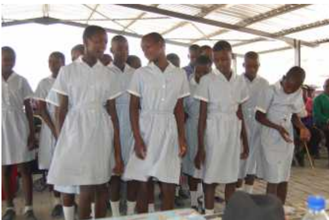
The choir performing