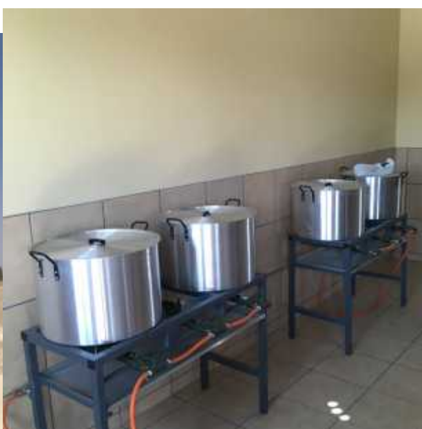
Left: View of the rear of the kitchen with the water tank to harvest the rainwater from the roof. Right: Aluminium cooking pots on the two gas ranges. A big thank you to Kondjeni architects for donating the gas installation including the cylinders, piping and ranges.