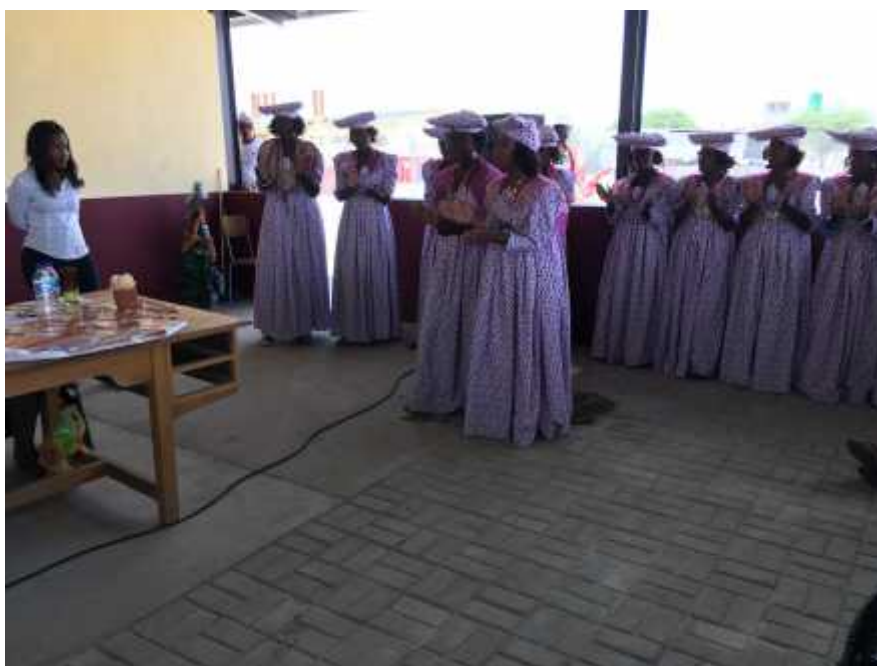
The senior girls in their Hereo dresses singing a traditional song